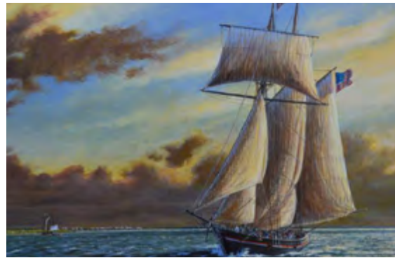
"Take it Back", William Robbins to the Rescue of Hannah Elizabeth.