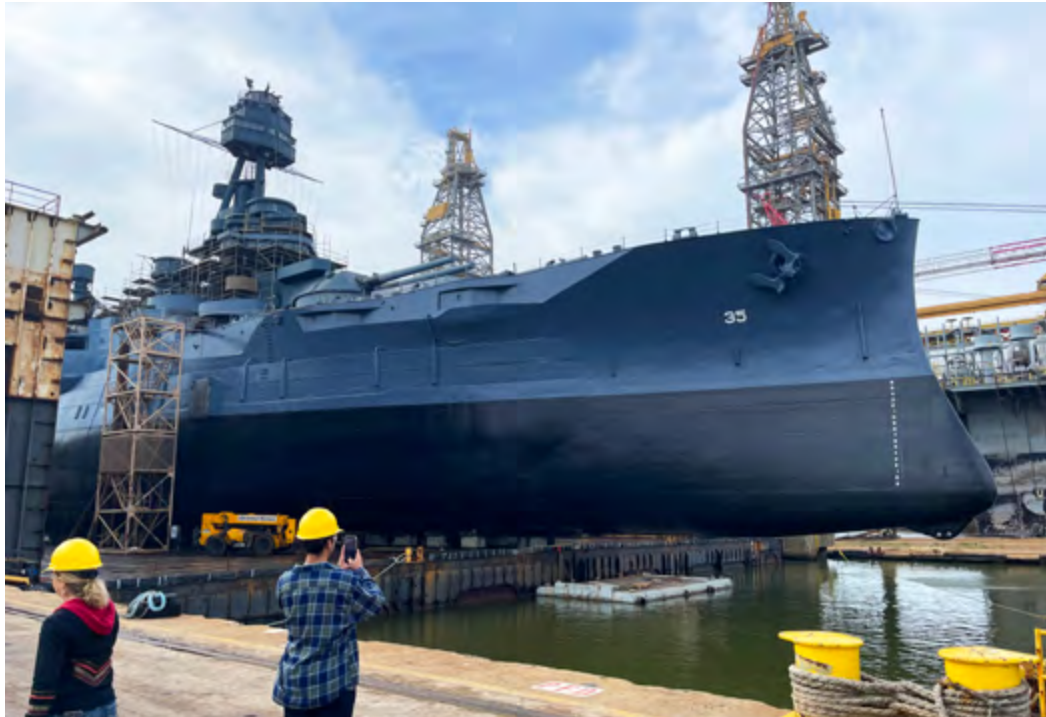
The bow of TEXAS, seen from an adjacent platform