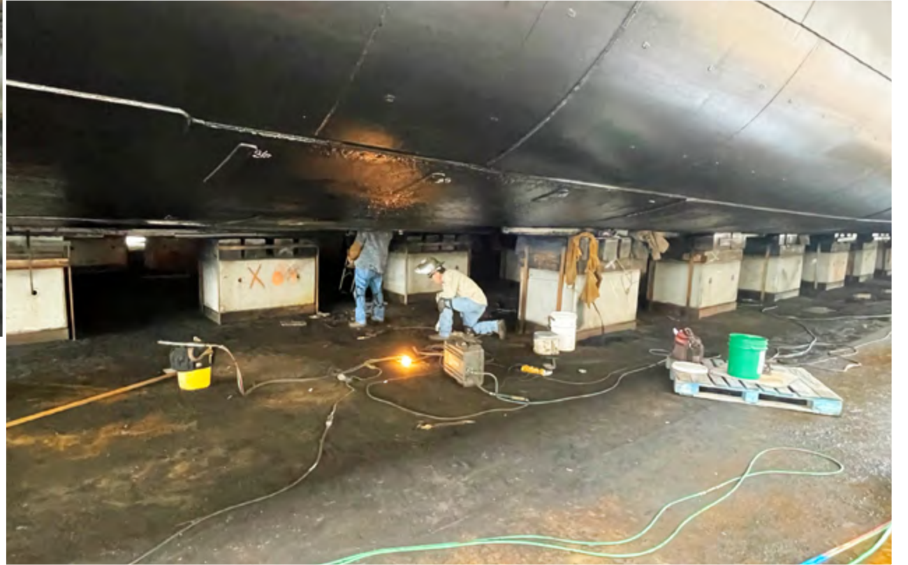
Workers continue making repairs to the Hull of the TEXAS during a partial-submergence test done in February, 2024.