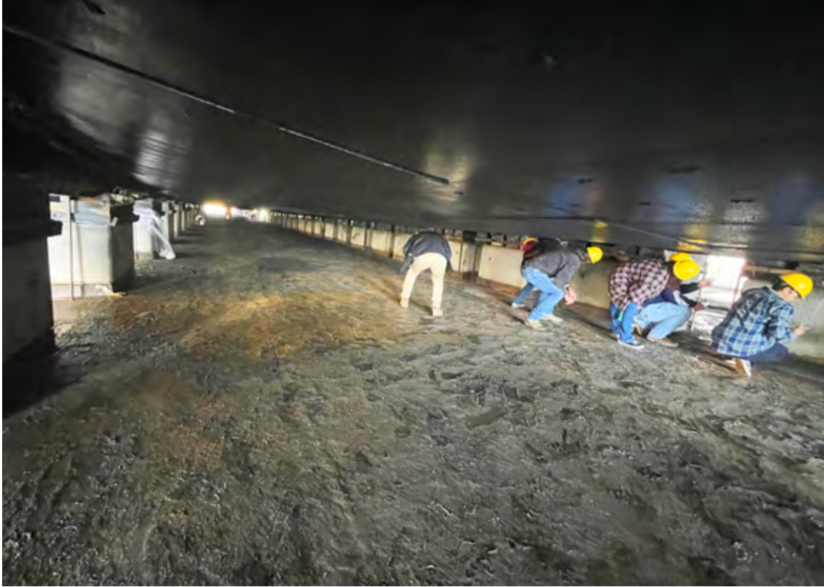
Visitors crouch low as they move under the Battleship's hull.