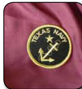
TN Logo Crest (Brocaded Cloth)