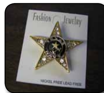
Ladies TNA Star Size: One and three quarter inches Regular Price: $6.00

With a purchase of $20.00 of Ship's Store purchase the TNA Star is $4.00