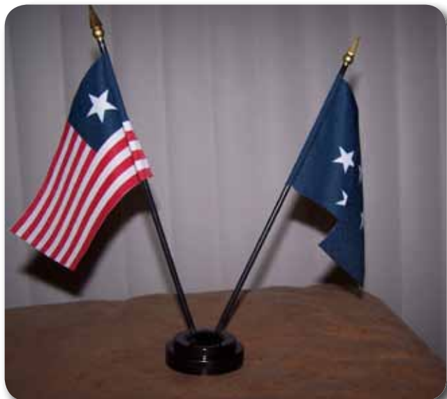
Newest Item! Texas Navy Flag Set $20.00