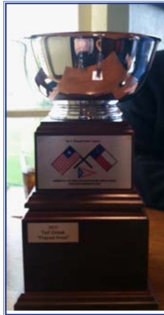
S. Rhoads Fisher Trophy